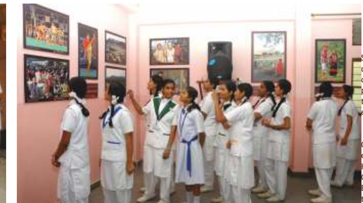
School children offering a prayer during the inaugural event