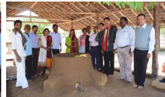
Inauguration ceremony of lime extraction exhibition at Traditional technology park