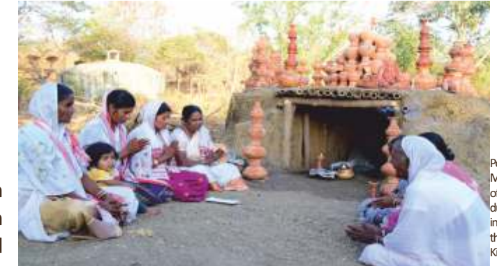
Potters from Majuli, Assam offering a prayer during the inauguration of their traditional Kiln

Another exhibit from Assam that reveals the traditional method of filtering water was also installed in this part of exhibition. Locally termed as Jal Suddhi Kalash, it is a traditional filter of pots made by laying one upon another and each of the chambers have their elaborate functions. The pot resting on the top is reserved for storing water while the middle one contains charcoal and sand. The third and lowest container collects pure water that receded and naturally filtered from the other two pots.