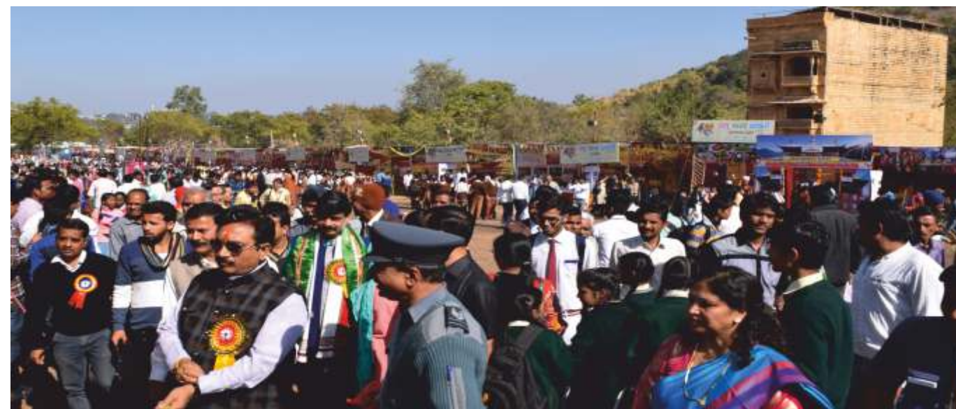
Glimpses of the cultural performances during the National Balrang Festival 2017