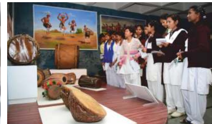
Students in a guided tour to the Ethno-music gallery of IGRMS