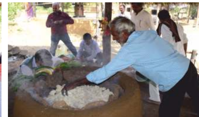
The artist from Andhra Pradesh demonstrating the extraction of lime