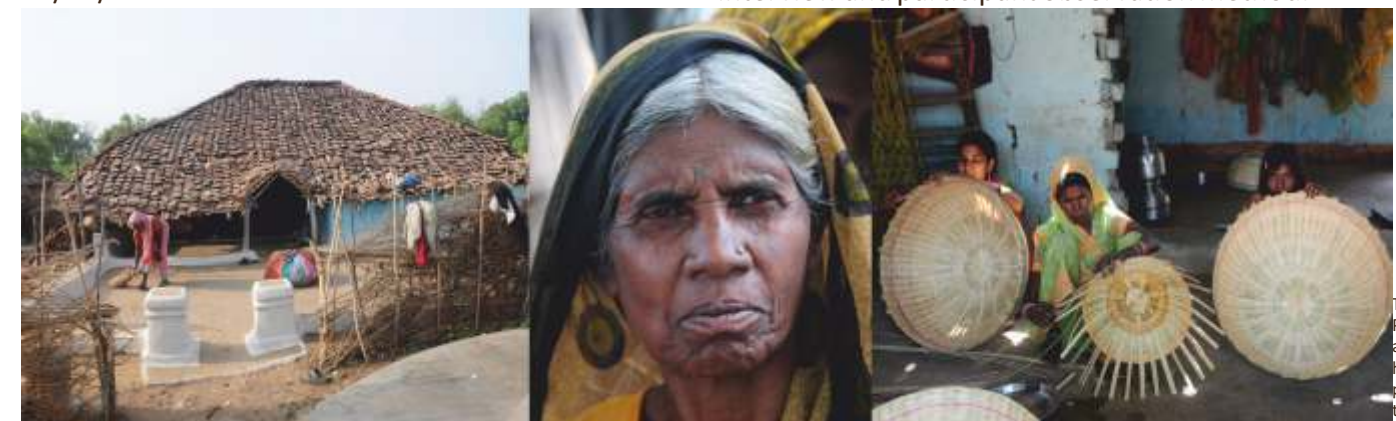
Tribal life of Pachmarhi at a glance - house type, people and their activities