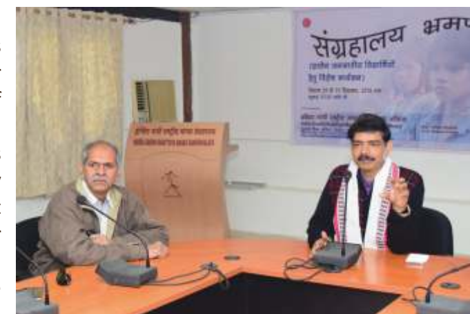
Director IGRMS, addressing the students during their educational tour at IGRMS