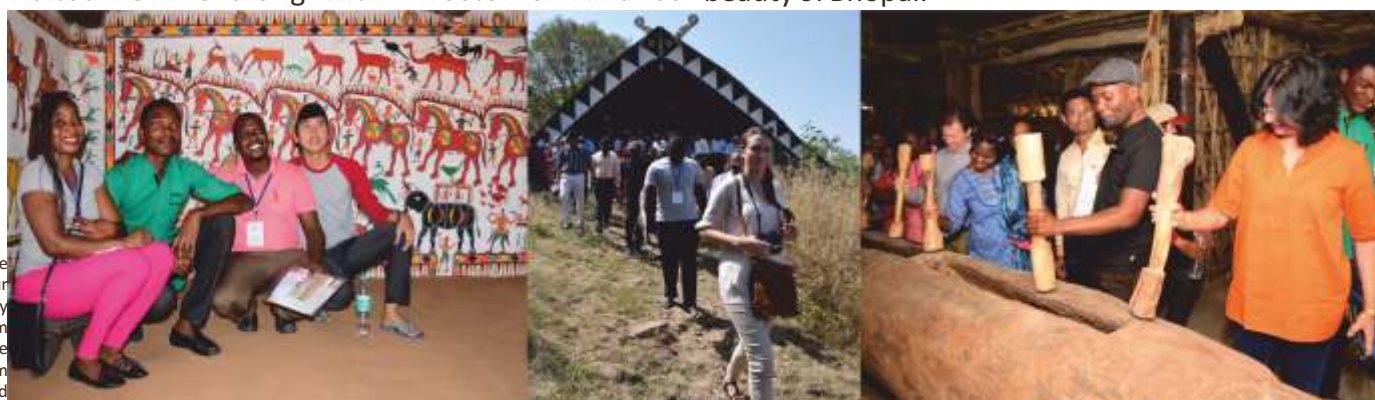
A view of the guided tour organised by the museum for the scholars from abroad