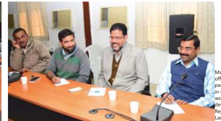
Museum officials participating in the workshop devoted to the Regional Language