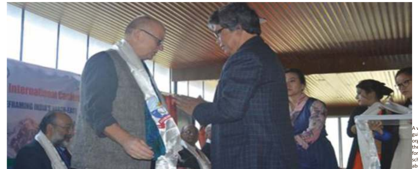
A view of the guided tour organised by the museum for the scholars from abroad