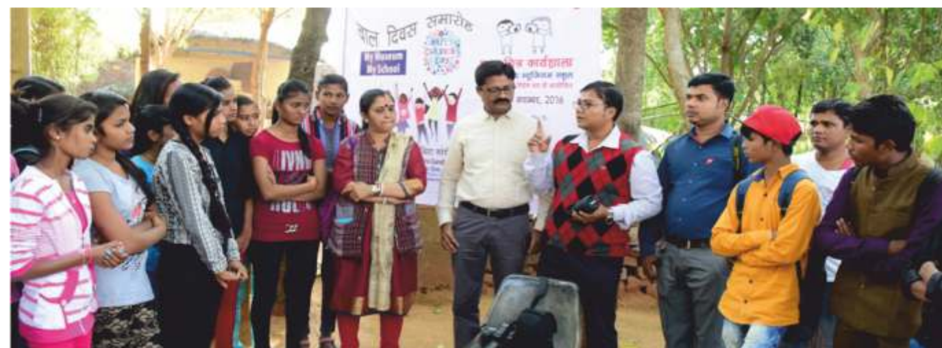
Officials of IGRMS imparting training to the students during the Photography Workshop at IGRMS