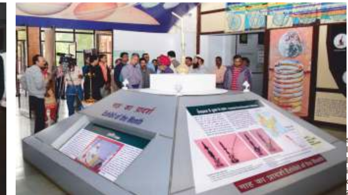
Zazir- a traditional smoking pipe decorated with papier mache craft