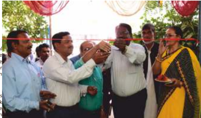
Inauguration event of the Heritage Corner exhibition

education. Students of Govt. HSS, Parwalia Sadak. Hence, this museum takes this pleasure to present the "Heritage Corner", an exhibition on India's North-eastern states. The country's cultural heritage protection is now the responsibility of the present generation. If we love for our nation's pride and identity, then we must know things of socio-cultural importance and ensure that the changes in our traditions don't affect our respect for them. The heritages in Manav Sangrahalaya mentally connect visitors with our national integration”.