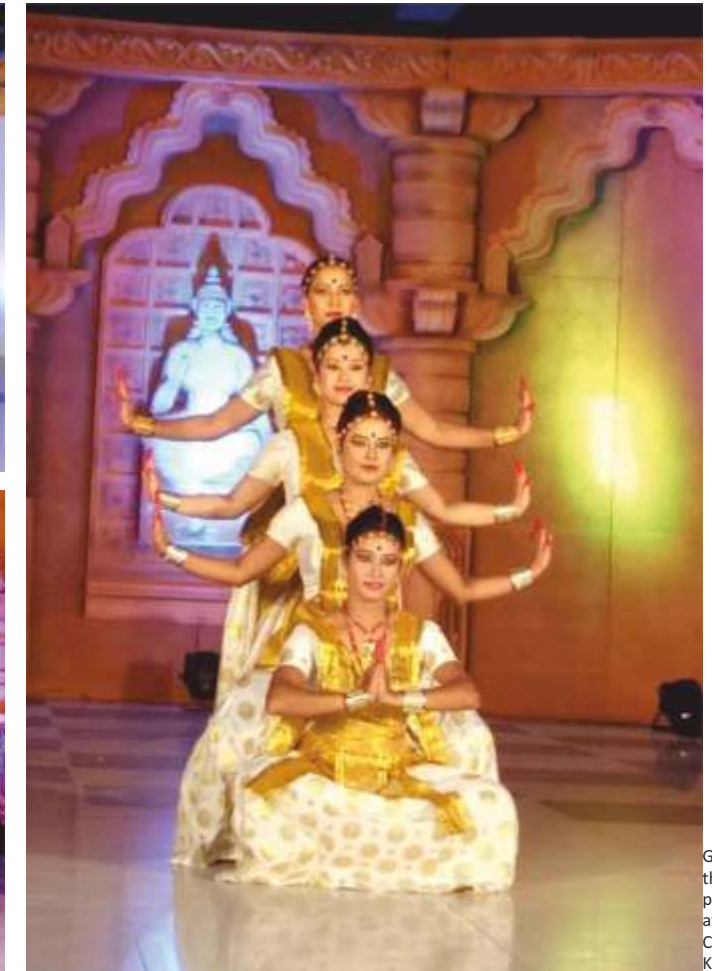
Glimpses of the cultural performances at the Film City, Bidadi, Karnataka.