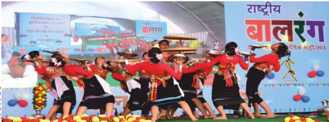
Glimpses of the cultural performances during the National Balrang Festival 2017