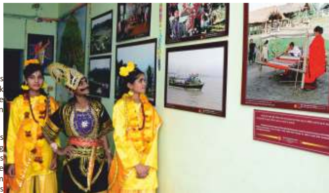
Students taking a look in to the Exhibition