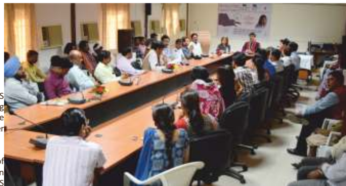
Screening of the animation film at IGRMS