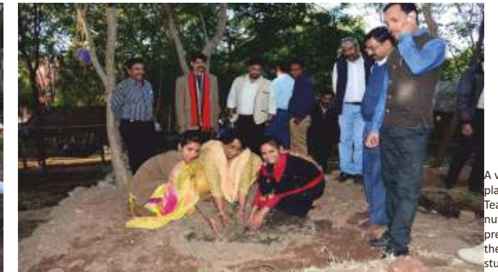
A view of the plantation of Tea and betel nut saplings presented by the North east students