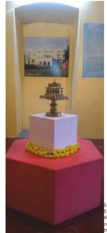
SENTHAK-SENKHA: A decorative ceremonial tray