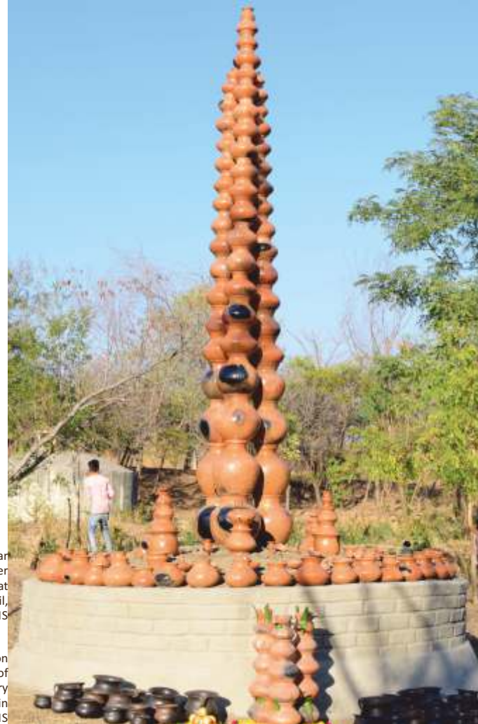
The popular Festive Tower of Pots at Potters Trail, IGRMS

The following three exhibits from Assam and Manipur were successfully developed during this workshop.