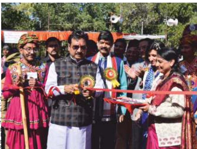
Hon'ble Minister, School Education, Govt. of M.P. inaugurating the National Balrang Festival 2017