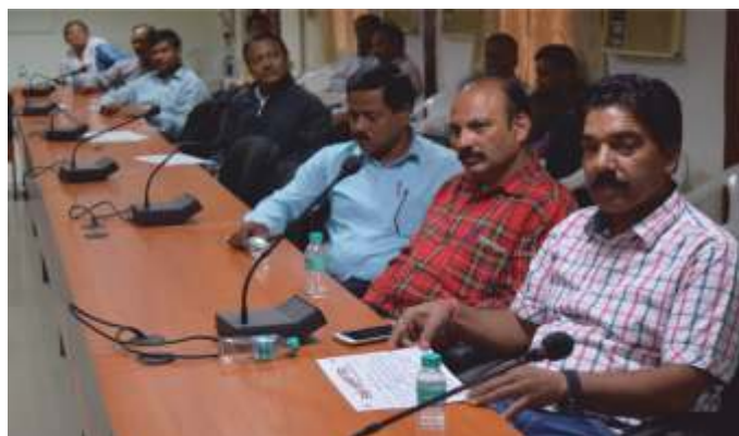
A glimpse of the museum officials taking a pride watch on the screening of Documentary Film on Sardar Vallabh Bhai Patel