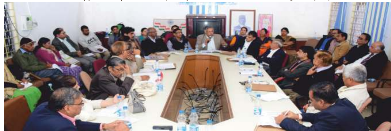
National Seminar at the Barkatullah University, Bhopal