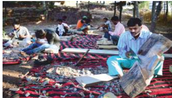
A glimpse from the museum workshop on wood carving at IGRMS