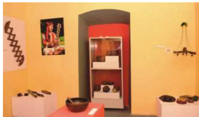
Photographs depicting various displays in Exhibition on Ethno-Musical Tradition of India

Traditional technology exhibition of Indira Gandhi Rashtriya Manav Sangrahalaya exhibits the various indigenous techniques used by the tribal and folk population of various parts of our country. A team of traditional artisans from Vizianagaram district, Andhra Pradesh renovated the existing traditional lime extracting exhibition complex. The traditional technology involved in the process of lime extraction from limestone using the traditional hearth were demonstrated by the artists to the general public after the renovation work. In this technique coal is mixed with limestone and heated up to 1400 degree Celsius which results in transformation of coal into ash and melted lime. The