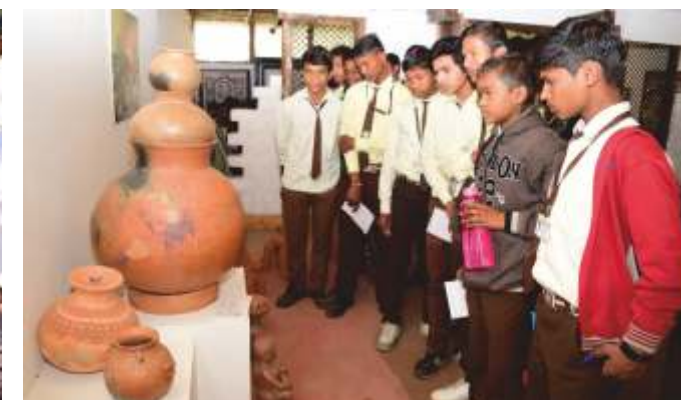
Students interacting with the Potters from Majuli, Assam and taking a look in to the exhibition