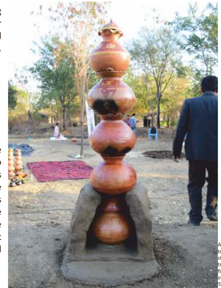
A view of the towering structure of traditional filter exhibited in the Potter's Trail, IGRMS